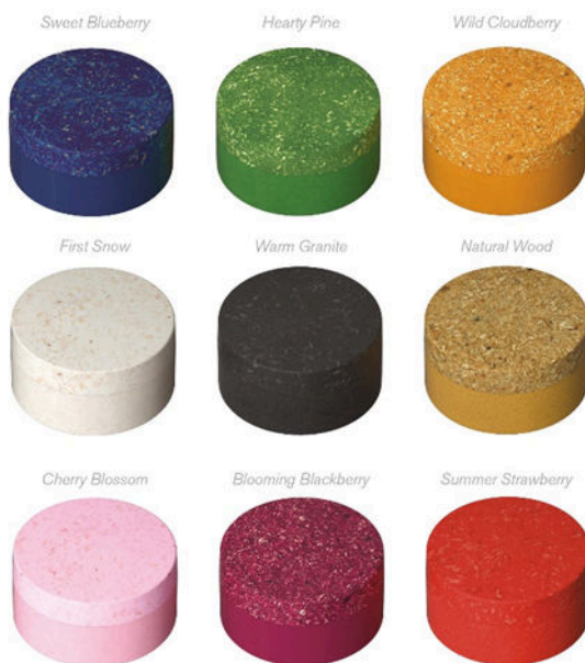
The ultimate appearance of the color depends on the material recipe it is applied to. Lids: Sulapac® Premium Bottoms: Sulapac® Universal

Sulapac’s colors have been inspired by Nordic nature. The Sulapac Universal for Injection Molding is by default Natural Wood -colored. Sulapac has 8 food contact approved color masterbatches that can be used to color the natural Universal Material. The recommended loading percentage or dosage of the color masterbatches is 0.5-4 weight-%.